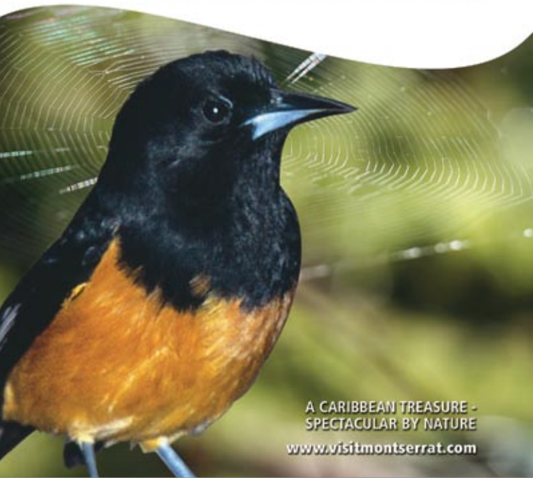
A CARIBBEAN TREASURE - SPECTACULAR BY NATURE www.visitmontserrat.com